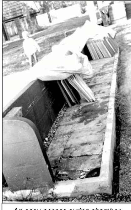
An easy-access curing chamber

The conclusion we can draw from these tests is that a higher temperature will always result from a clear plastic.