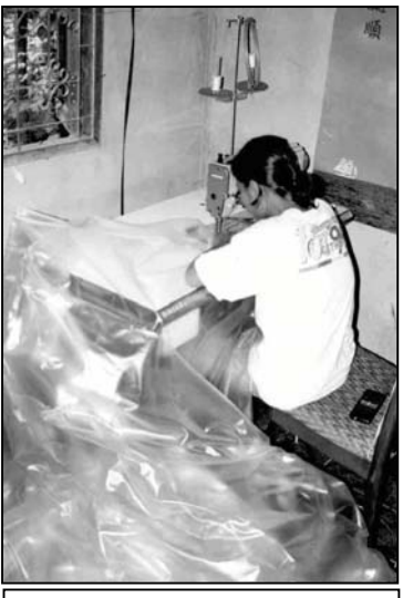
Sewing a concrete curing tarp