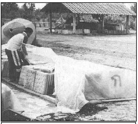
An easy-access curing chamber can be stepped into.

Reduced curing time means fewer curing chambers are required and less stock is kept in the curing chamber. Having excess capacity of curing chambers is not necessary. There are other factors affecting the time it takes for a product to pass a strength test. Things that increase the curing time include: using a lot of water in the concrete mix, a cold temperature. Things that reduce the curing time include: using less water, using a superplasticizer (a chemical additive