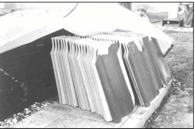
Cover the last tile with a "grade B" tile to prevent shrinkage cracks.

In the case of concrete blocks or stabili blocks directly in the stock area and then cover lower cost. The moisture inside the blocks may