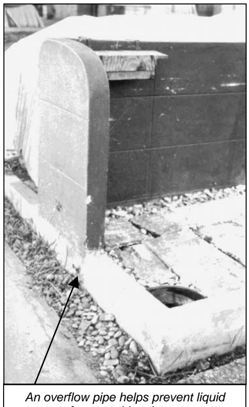
water from touching the concrete products and causing efflorescence.

PO Box 39493 22 Chiromo access Road, Off Riverside Drive Nairobi, KENYA AFRICA Phone 254 2 442108 FAX 254 2 445166 Email elijah@itdg.or.ke