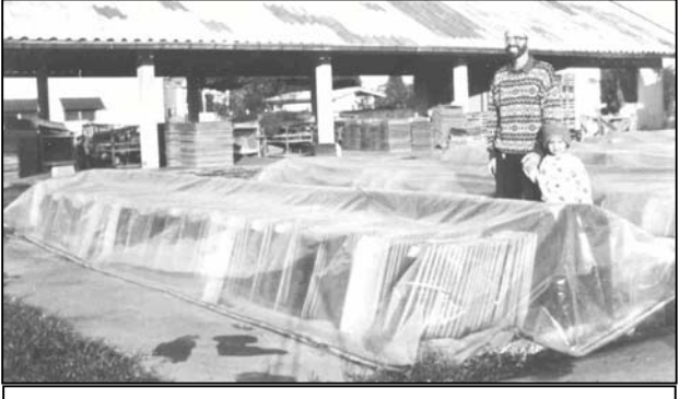
A high-humidity easy-access solar curing chamber

Some clear plastic tarps are better than other clear plastic tarps. Ideally we want a plastic which will let in as much sunlight as possible and trap it inside as heat. In scientific terms we might say we want a plastic that is